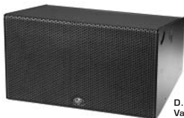
D.A.S. Audio Variant 112A