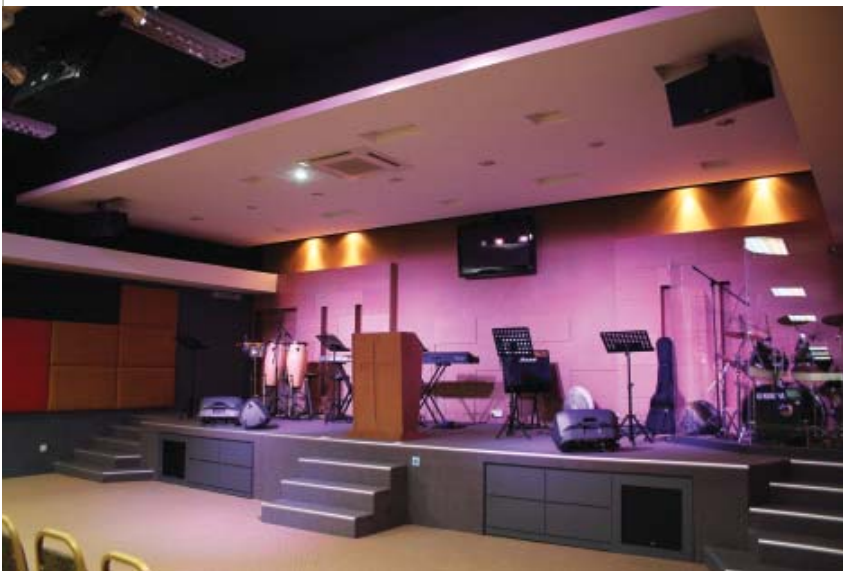
Calvary City Church

In regards of the specific characteristics of the project, Isaac indicates, "Due to the height limitation upon studying the venue, we were prevented from using the Variant 112A system in a Line Array configuration. Thanks to the versatility of the Variant Series, we decided to use 4 Variant 112A cabinets in single full-range mode, combined with 2 Variant 18A Subwoofers for the FOH System. Adding two more cabinets at the centre of the hall as a delay speaker system, a uniform sound pressure level covering the audio spectrum was achieved from the first rows of audience seating to the last. Albert Cheam commented on the new system: "After two years using the Variant 25A in our main hall for the services, we were very satisfied with the system, in terms of reliability, performance and a great service by Isaac, our system integrator. So when there was a need of a new venue that needed sound reinforcement, we decided to go with the tried and tested D.A.S. Audio products for our system in the new hall, without considering any other brand available in the market. Having a local representative in our city was also important for us to take the decision. The service, support and quick-response times from these representatives have always been good and are vital to a church that spreads