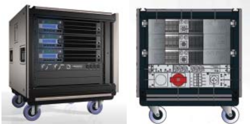
LA-RAK with LA8 Amplified Controller

With the "Made in Germany" quality label, the base•cap is a compact fog machine with a real low power requirement (650W) and a low fluid consumption as well (60ml/min at max. output and 15ml/min at continuous fogging). At the same time it has got a huge output. Voltage is 230V/50Hz (120V/60Hz also available). The fluid tank capacity is 2ltr. With the dimensions of 31.3 x 29 x 21.3cm, the size of unit is quite 'tiny' so there will be space for this unit nearly everywhere. Without liquid the weight is 5.8kg only. base•cap comes with DMX and an integrated timer and can be used with optional radio remote control and cable remote control as well. base•cap can be adjusted between 1-99% output. The delivery includes a ducting adapter with a diameter of 65mm - and all this for a real fair price-performance ratio. www.base-cap.info