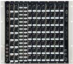
Cadac's S-Digital & System Rack