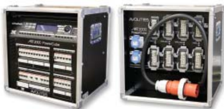
ART2000 Power Cube

Designed for a broad range of applications from small radio or internet broadcast studios, the XB-14 is equipped with a wealth of features specifically for broadcasters, including 4 mic/line channels, 4 stereo channels and 2 Telco telephone communication channels, with 3-band EQ on the mono channels and 2-band EQ on the Telco and stereo channels. There is a single aux bus for external effects processing, recording or auditioning, and a separate 'Mix B' stereo bus for recording an independent mix to the main programme mix, or creating a clean feed source with selected channels. The XB-14 also has USB connectivity for interfacing with PC/MAC to access computer-based audio files and content management systems, whilst simultaneously outputting programme, aux or Mix B feeds in digital format. www.allen-heath.com