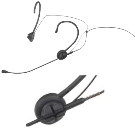
beyerdynamic TG-X54 & TG-X55