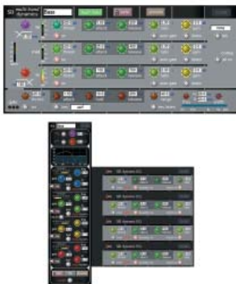
SD7 MACH2 Multi Band Compression & Dynamic EQ screen