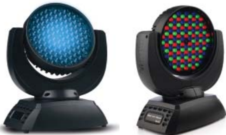
Martin MAC 301 Wash

Martin Professional's Maxedia 4™ RC is the latest software update for Martin's user-friendly Maxedia™ media server. The new software features an entirely new video engine using the latest high-performance professional video codec. The new video engine is optimized to play multiple Full HD 1080p H.264 MPEG-4/AVC MOV&AVI Professional Codec. Improvements with Maxedia 4 include: Pixel accurate video output; Support for ultra-widescreen; Multi-screen keystone and edge blending; Pixel mapping for RGB and CMY fixtures; Support for Live HD-SDI capture video input; Live diagnostic tool; CIP 1.1 protocol remote thumbnails; Higher resolution support for Maxedia Pro™ and Maxedia Compact RM™. Existing Maxedia owners can contact paul.pelletier@martin.dk with the serial number of the Maxedia system should they wish to upgrade. www.martin.com