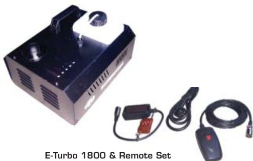
E-Turbo 1800 & Remote Set

The ARC 1200 is an architectural colour changer with IP55 protection level, fitted with a discharge 1200W lamp (92,000 Lumens/MSD 1200; 110,000 Lumens/MSR 1200/4) and is suitable for illuminating exteriors, interiors and in the most demanding applications requiring a projector capable of colouring large areas at long distances with an intense and uniform light beam. ARC 1200 offers an extremely high luminosity, superior to other projectors fitted with a 1200W lamp or even more powerful ones and incorporates a CMY colour mixing system, a 3.200°K colour conversion filter, Dimmer/Shutter/Strobe, rotating beam shaper (0° – 360°) controllable via DMX, internal Macros, independent operation (Master/Slave mode), 13 preset programs + 1 programmable. ARC 1200 is available with electromagnetic ballast or with electronic ballast. www.dts-lighting.it