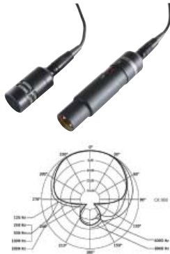
beyerdynamic CK950 & CV900 (top), Polar pattern for CK950