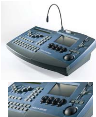
SGM Pilot 3000

The amazing Robin 300 Plasma Spot moving head is the first to take advantage of a highly efficient electrodeless lamp that uses radio waves to create a plasma inside a small glass bulb emitting 95 lumens per Watt. The Robin 300 Plasma Spot has a perfect colour rendering index of 94, an extremely flat and even light beam of 1:1.4 and a lamp lifespan of 10,000 hours. The plasma lightsource offers a smooth dimming between 20-100% and strobing. The fixture has a linear motorized zoom range of 10°-40° (patent pending), and the innovative RNS2 - Robe Navigation System which also has a gravity sensor for screen auto-positioning (patent pending). Other features include CMY and CTO dichroic colour system, gobo wheel, super-fast motorized iris, and variable frost effect. Pan and tilt movement is available in either 16 or 8 bit resolution 540°/280°. www.robe.cz