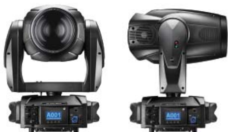
D.T.S. XR2000 Beam

Good news for all DiGiCo SD7 users, the new MACH2 software suite offers even more power from the Super FPGAs in DiGiCo's Stealth Processing engine. MACH2's huge enhancements include: DiGi-TuBe- the world's first Super FPGA preamp tube emulation, with full drive and bias control; Dynamic EQ – on all 256 processing paths and on all four EQ bands; Multi Band Compressor– on all 256 paths, adding an extra two compressors per path giving a further 512 dynamics to the console; Effects – with 16 floating point stereo Super FPGA Stealth digital reverbs; Talk-to-buss with dim function– a dedicated talkback channel that can be routed to any aux buss, allowing direct communication to any wedge or in ear mix; Eight bands of Parametric EQ– for all 128 busses for auxes, groups and matrix adding 512 bands of EQ to the console. MACH2 is free to all existing SD7 owners. www.digico.org