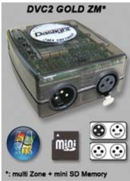
DasLight DVC2 GOLD ZM