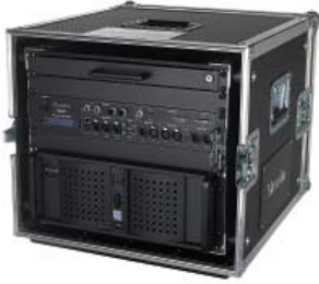
Martin Maxedia 4 & Maxedia media server