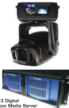
Barco DL.3 Digital Light & Axon Media Server

Barco has made significant enhancements to their DX-700 LED processor, designed to provide extremely low video delay for interlaced sources, without compromising the system's high image quality and scaling capabilities. The new DX-700 now offers an extremely low latency "minimum delay mode" providing less than 2 ms of delay for interlaced and progressive sources in both SD and HD formats. A new "reduced delay" mode is introduced providing superb image quality at a much lower video processing delay — less than 2 ms for progressive sources and up to 25 ms for interlaced sources. With these new enhanced delay modes, the total DX-700 delay working in conjunction with Barco's true black NX-4 and NX-6 LED walls can be as low as 42ms for 50Hz and 35ms for 59.94Hz applications. www.barco.com