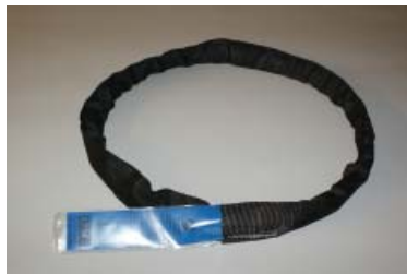
LTM Soft Steels