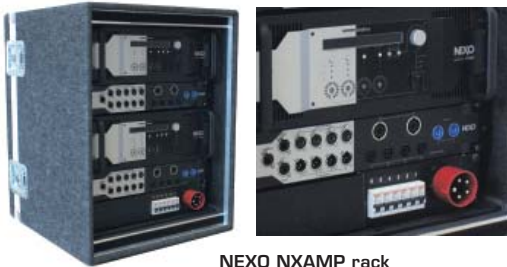
NEXO NXAMP rack

The MAC 301 Wash™ is an LED moving head washlight utilising 108 high-power LEDs to produce an extremely bright and well-defined beam, in fact, the MAC 301 Wash is the brightest LED moving head in its class. With an efficient and fast zoom beam angle control from 13-36° with the fixture's outstanding RGB colour mixing maintained through the entire zoom range. A principal feature of the MAC 301 Wash is its excellent RGB colour mixing system which is augmented by an electronic 7+white colour wheel rotation effect with snap, blackout or dimmer fade at each colour change. Additional features include: Smooth dimming from 0-100% with excellent colour stability; Strobe effects; High-speed 430° pan and 300° tilt movement; Automatic positioning correction system; and an illuminated graphics display for easy programming. www.martin.com