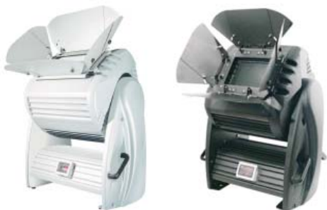
D.T.S. ARC 1200 Grey & Black

The XR2000 BEAM is a new compact moving head with an extremely high light power, projecting a parallel and very concentrated beam. With its new lens unit, XR2000 BEAM generates exceptional luminosity of 150,000 Lux at 5m, using only a 700W lamp, giving an exceptional balance between performance and power consumption. XR2000 BEAM offers: The capacity to project a highly condensed and intense beam of light even over great distances, thanks to the high efficiency of the new lens; Variety of colours (linear CMY synthesis + wheel with 7 colours); Customizable gobo wheel; Insertable frost filter (soft edge); Fast and uniform Pan and Tilt movements. Access to every feature of the internal menu is simple and direct, thanks to the new user interface featuring a LCD backlit graphic display (128 x 64). www.dts-lighting.it